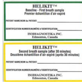
Figure 2: Identification labels